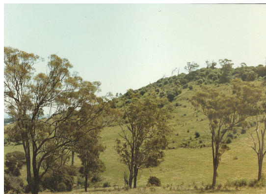
Left: The beginning of an African Olive infestation at Mt Annan, 1984 and

African Olive has been reported to pose a significant threat to the endangered